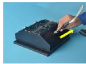
3) Pull out