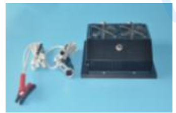
4) Completed disassemble