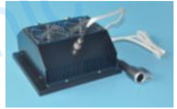
4) Completed installation