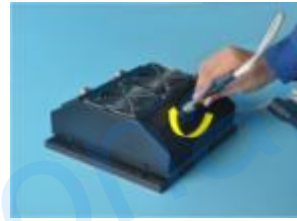
3) Clockwise rotate to lock