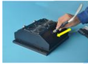
2) Align and insert