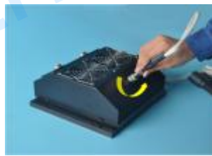
2) Anticlockwise rotate to unlock