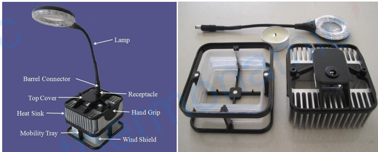
Structure of the Tealight-Lamp

The new Tealight-Lamp is a LED Lamp powered by a tea candle, not electricity and not battery not pollution. The secret behind is that the LED lamp come with a built-in miniature electricity generator! Thanks to the thermoelectric technology, Thermonamic`s engineer team designs and builds up a mini size generator in the world, which can convert the heat of a burning tea candle directly into the electricity. The Tealight-Lamp provides you the lighting that is brighter than 24 tea candles can offer in same time, brightly enough for comfortable reading. The unique mini and light power-on-demand thermoelectric generator lights up our Tealight-Lamp almost 4 hours per a tea candle, well suited for the off-grid camper, backpacker, hunter, or fisherman, and for those whose work takes them into not electricity areas. In situations where power is lost at home, the Tealight-Lamp is a must-have item for home emergency preparedness, an alternative to battery powered lighting, not charging not pollution.